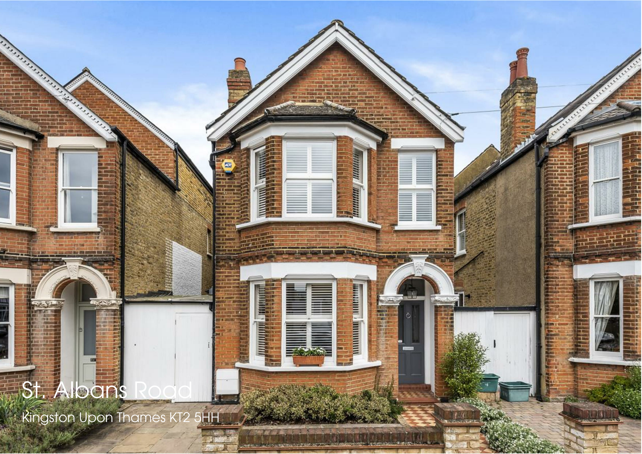
St. Albans Road Kingston Upon Thames KT2 5HH

34 Richmond Road Kingston upon Thames Surrey KT2 5ED www.gibsonlane.co.uk Tel: 020 8546 5444